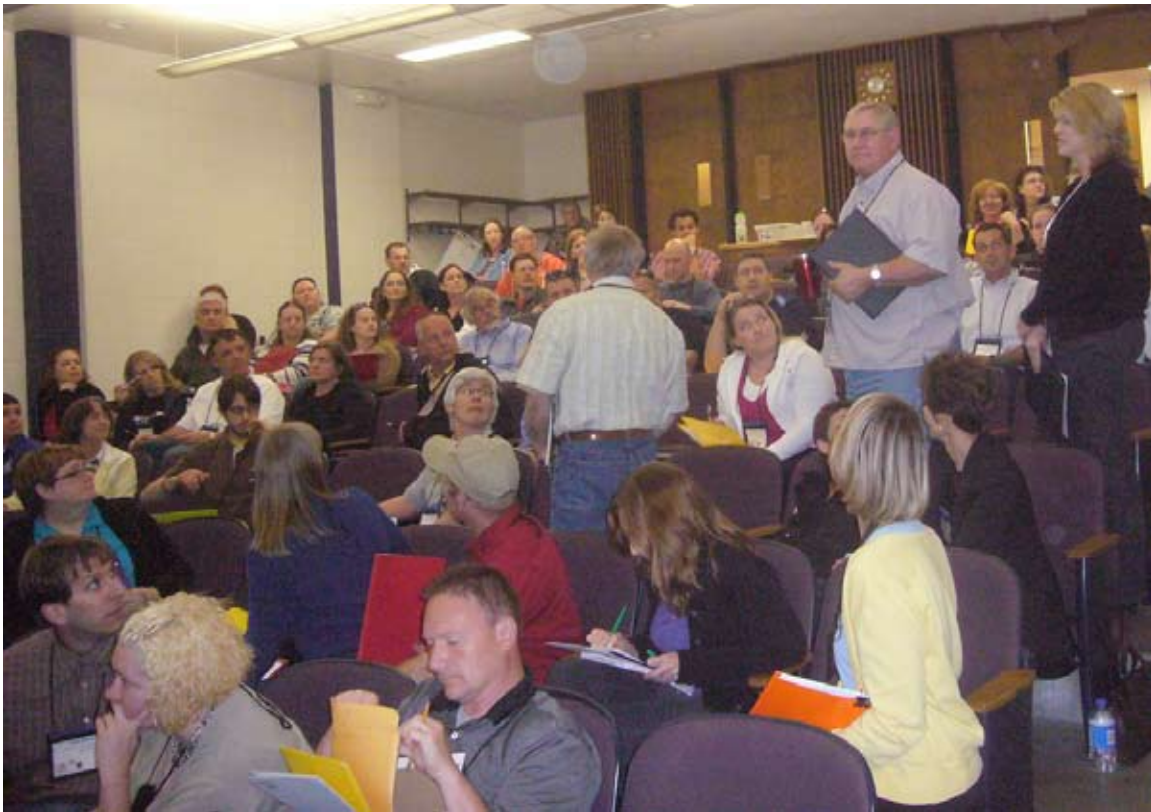
Pre-Academy meeting, April 17, 2010. Physics Building, MU